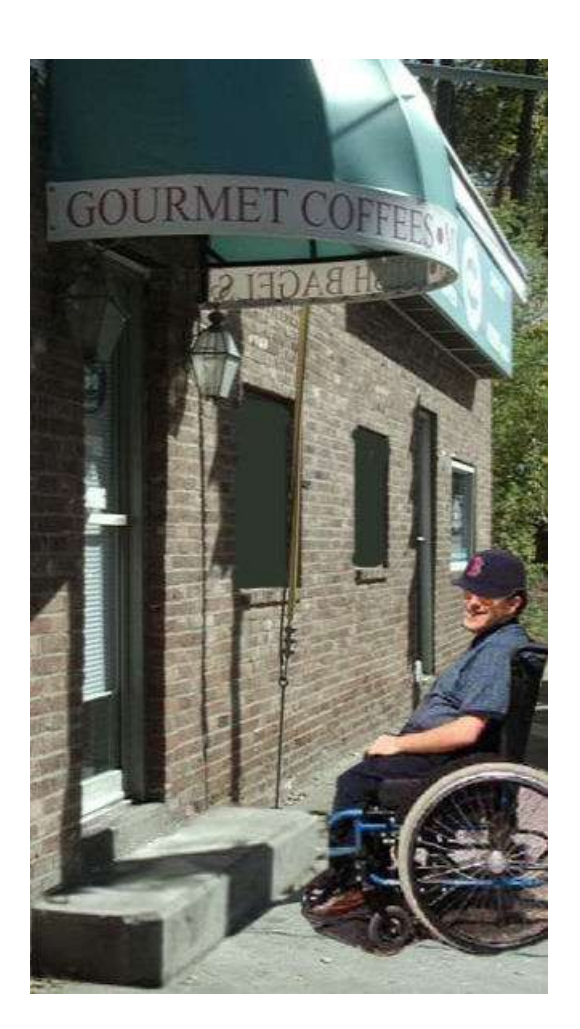
By The Andover Commission on Disability

Conducted in 2004-2007 to Coincide With the Town of Andover's Main Street Project