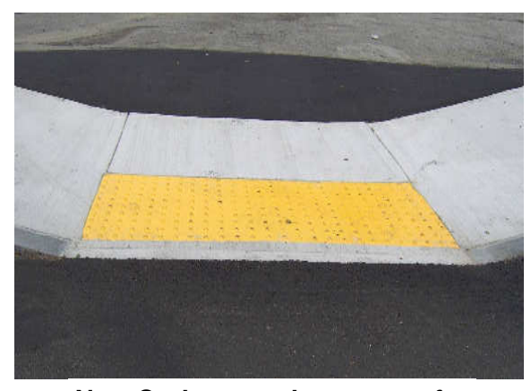
New Curb cut at the corner of Andover Street and Dale Street

The detectable warning is made up of "truncated domes" that have had their tops cut off or truncated. The truncated domes are placed relatively close together and can be detected by one's feet or when using a long cane. Originally instituted at crosswalks and other hazardous vehicular ways by countries like Japan and the United Kingdom, among others, the United States picked up the standard after passage of the Americans with Disabilities Act in 1990.